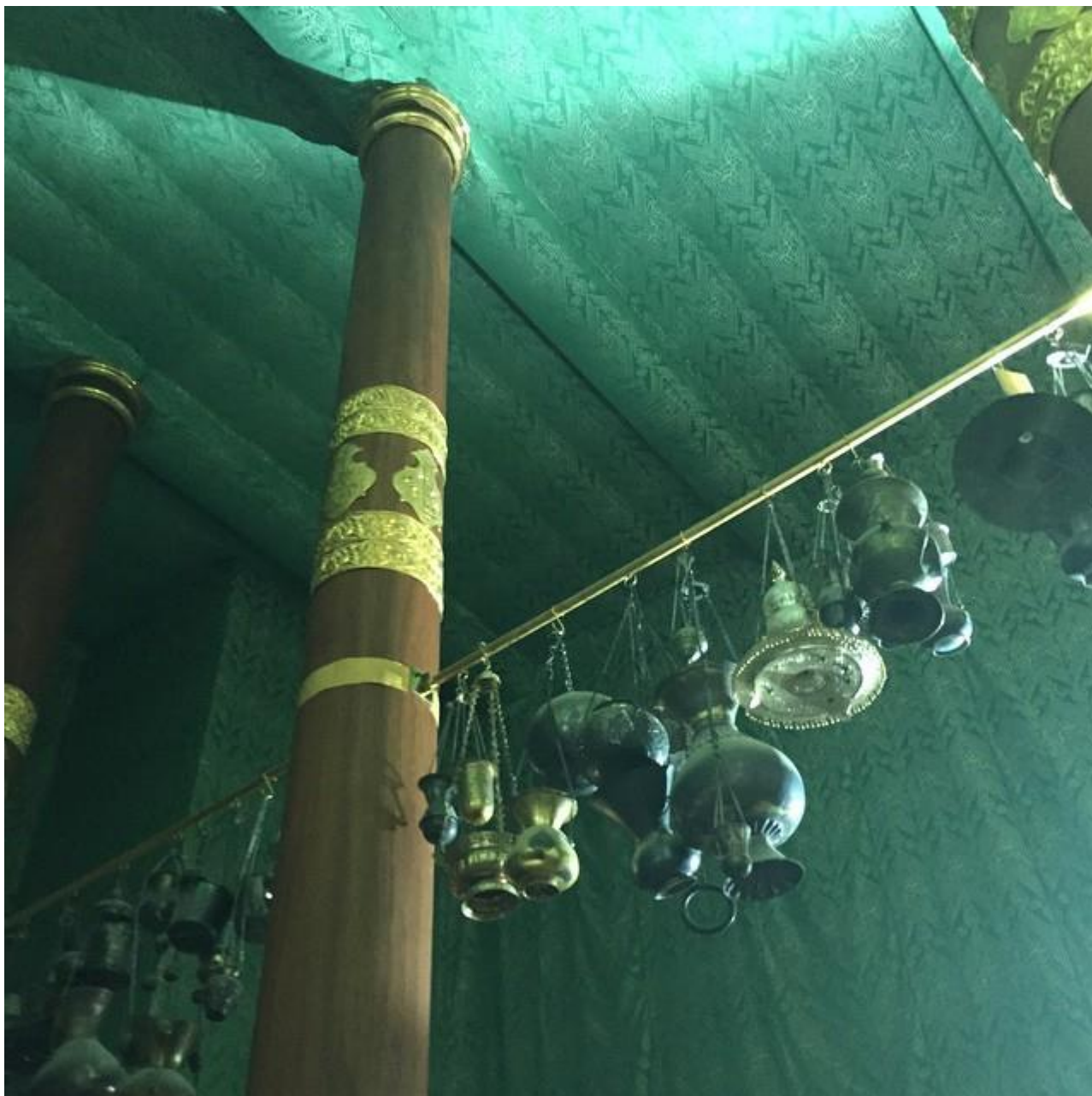
There are lamps hanging in between two pillars in the centre of the Ka'ba.