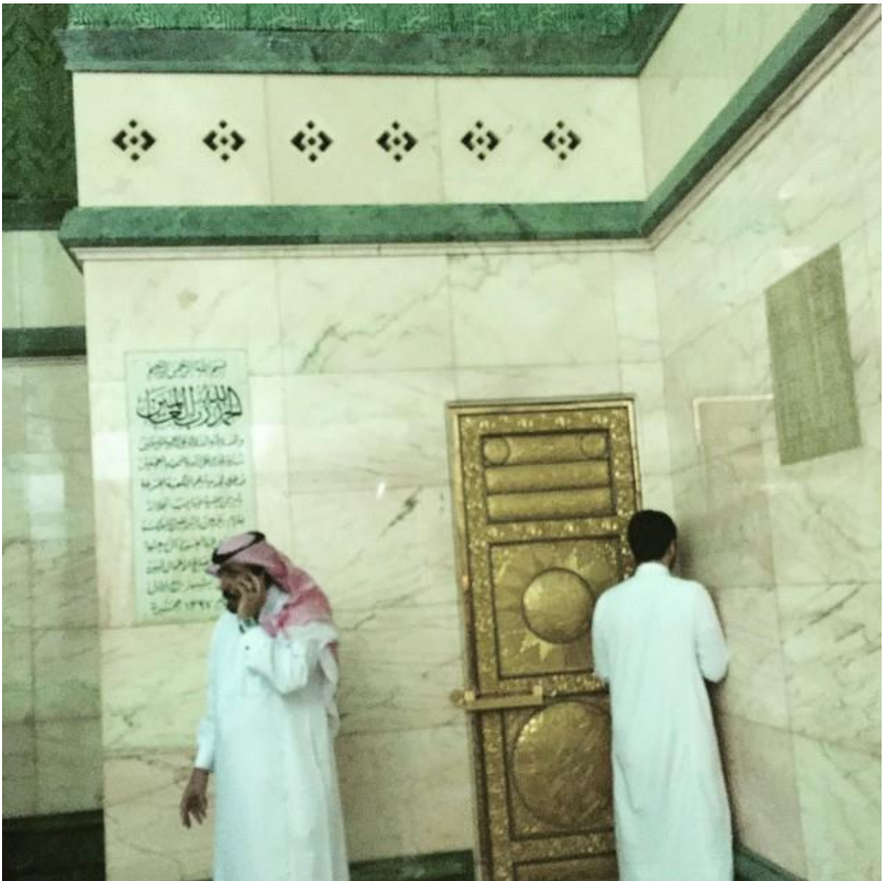
This door leads to the roof of the Ka'ba.