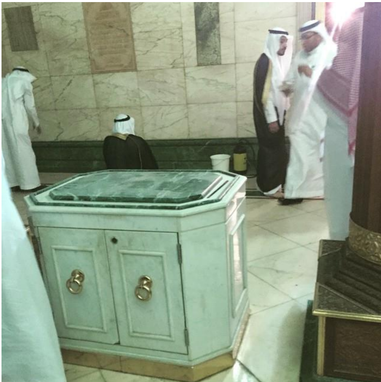
A table upon which Bakhoor (fragrance) is placed.