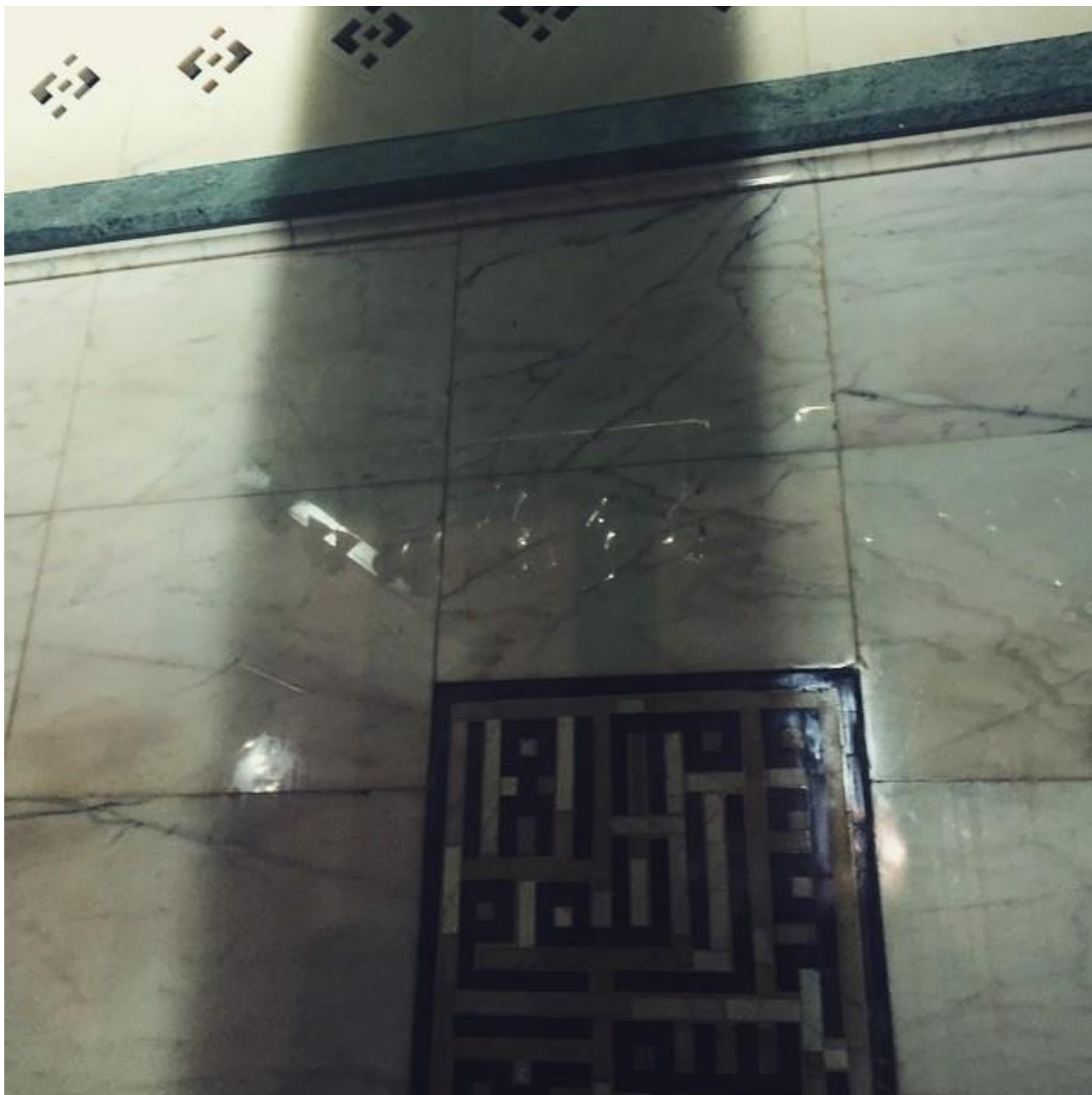
The calligraphy on the marble wall denotes the location the Prophet Muhammad (peace and blessings be upon him) prayed when he entered the Ka'ba.