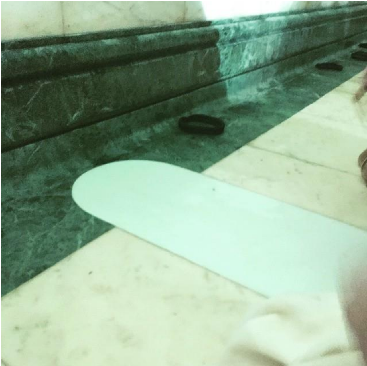
The marking on the floor shows the exact spot the Prophet Muhammad (peace and blessings be upon him) is thought to have prayed.